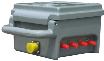
Mini TRS Inputs

The TRS Plus can be operated via the integrated keypad and display or via a serial link with a computer or modem. Upon power up, the TRS is completely menu driven for ease of use in the field. To serve the special needs of many different users, the TRS options include: solar panel, expandable memory, environmental sensors and WIM.