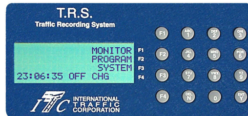
Display and Keypad