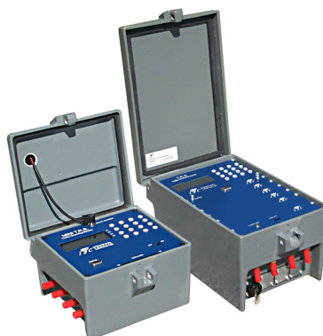
Mini TRS and TRS